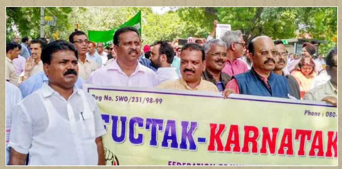
Observation of Black day at Delhi on 5th Sept. 2017