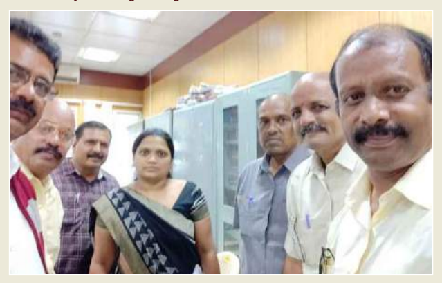
AMUCT Delegates at FUCTAK Meeting in Bangalore