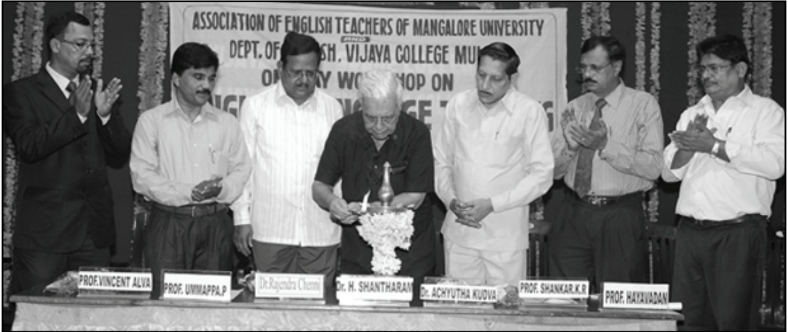
One day Workshop of Association of English Teachers held at Vijaya College Mulky on August 1, 2011